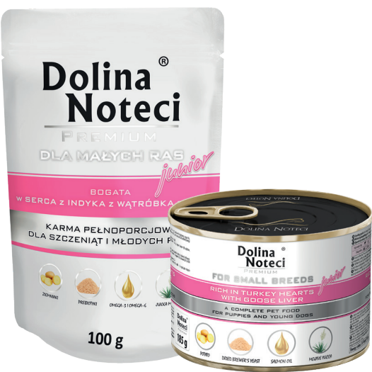
A complete pet food for puppies and young dogs of small breeds rich in turkey hearts with goose liver

Additives: nutritional additives/kg: Vitamin D 3 – 450 IU, Vitamin E – 40 mg, Zinc (zinc oxide) – 30 mg, Manganese (manganese (II) oxide) – 2 mg, Copper (copper (II) sulphate, pentahydrate) – 0.4 mg, Iodine (coated, granulated calcium iodate, anhydrous) – 0.3 mg.