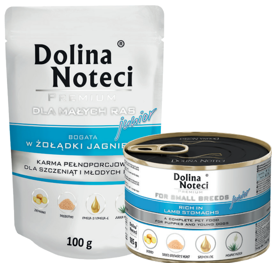
A complete pet food for puppies and young dogs of small breeds rich in lamb stomachs